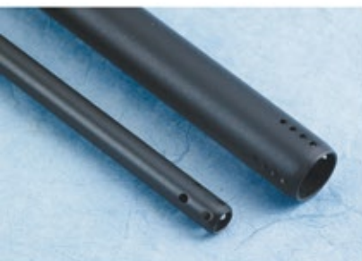
Ø5 mm/10 mm cannula